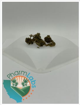
*Dry Weight %

Analyzed Dec 06, 2022 | Instrument Chilled-mirror Dewpoint and Capacitance | Method SOP-008